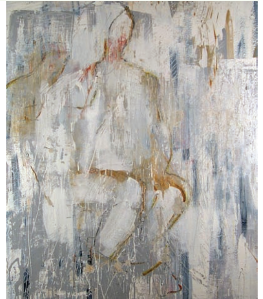
Ego Velo 3 by Sasha Blanton

For more information on art donations and nonprofit applications, please contact the Art Connection at 202-333-5154 or email info@artconnection-cr.org